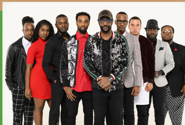
THOMAS MCCLARY AND THE COMMODORES EXPERIENCE WILL HEADLINE THE 2025 SC PECAN MUSIC & FOOD FESTIVAL

The SC Pecan Music & Food Festival is guided and presented by a volunteer committee which assists in the development and implementation of the entire event. Planning takes place over a 10-month period each year and takes over 1,000 volunteer hours. The SC Pecan Music & Food Festival is a charitable program of the Florence Downtown Development Corporation, a 501(c)3 non-profit corporation.